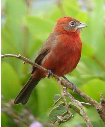
Red Pileated Finch

Lodging this Evening: Hotel in Chapada dos Guimarães